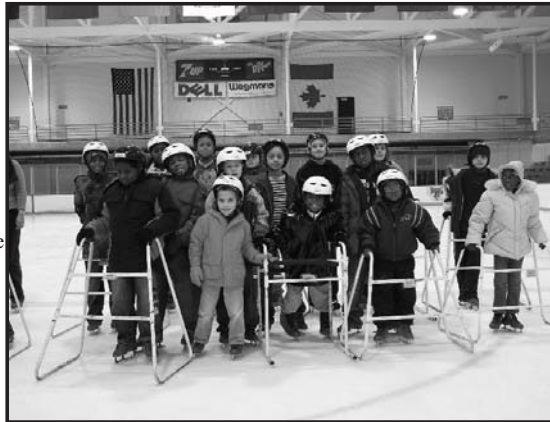
Buffalo School 84 skating at the Riverside Rink

In the School-Day Program, each class is required to set individual student goals for the SABAH program. Specific activities to be addressed in the weekly lesson plans include: dressing skills, skating skills, social skills, appropriate peer interaction, interaction with different persons (volunteers and instructors) and following directions. The lesson plans also incorporate a physical and occupational therapy component. Learning objectives are linked with New York State Educational Standards & Alternative Assessments for Students with Severe Disabilities. For more information, contact Bob O' Connor at 362-9600, Extension 10.