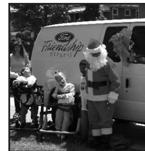
SABAH Athletes and Santa Claus

Faced with greater transport needs as our School-Day and Evening/Weekend programs grow and our community activities increase, it became apparent that the Ford Friendship Express might be an ideal fit for SABAH. In February of 2006, SABAH submitted a grant proposal to the Western New York Ford Dealers