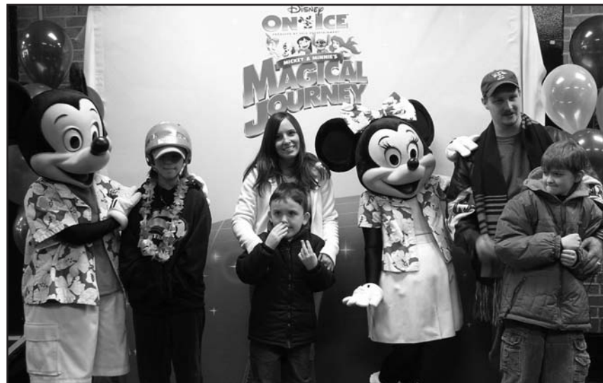
Disney On Ice Stars with SABAH School Day Skaters at the Riverside Rink