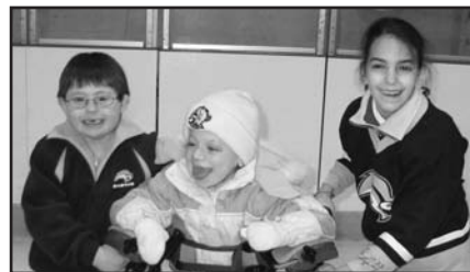
Some SABAH ambassadors skating at Hamburg

Download your application today at www.sabahinc.org under the NEWS/EVENTS section.